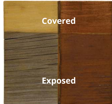
Sashco® Transformation Stain® Log & Timber