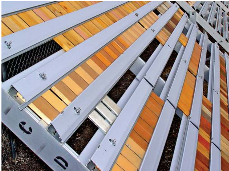
Stain Panel Exposure Racks Denver, Colorado