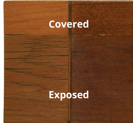
Sashco® Transformation Stain® Log & Timber