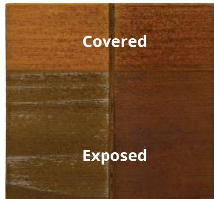
Sashco® Transformation Stain® Log & Timber