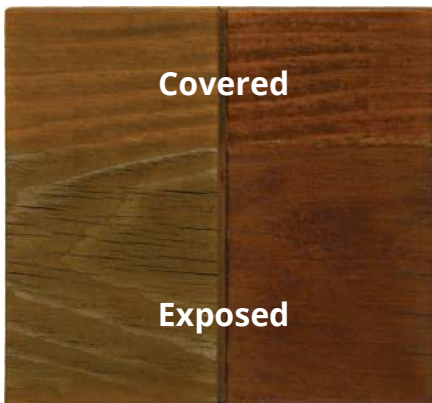
Sashco® Transformation Stain® Log & Timber