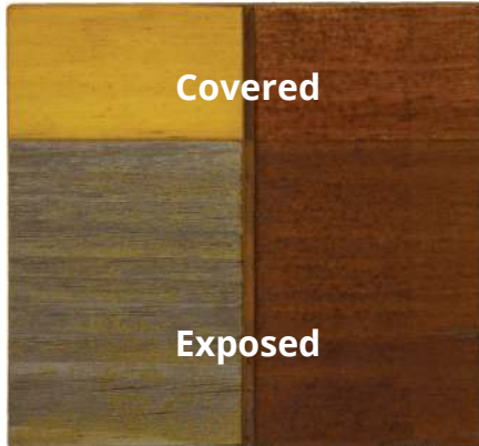
Sashco® Transformation Stain® Log & Timber