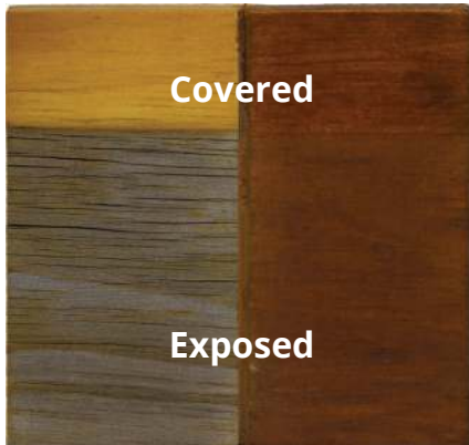
Sashco® Transformation Stain® Log & Timber