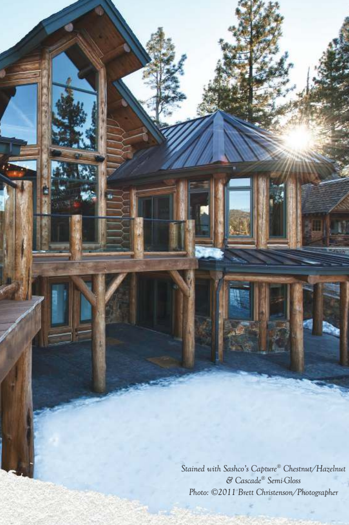
Stained with Sashco's Capture® Chestnut/Hazelnut & Cascade® Semi-Gloss

Performance worthy of the journey that got you here.