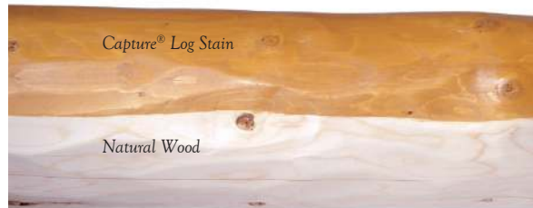
Stained with Sashco's Capture® Chestnut/Hazelnut & Cascade® Clear Coat.

Capture® Log Stain brings your logs to life as it enhances the unique character of the wood grain.