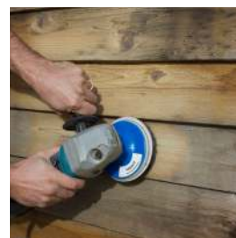
Buffy Pad System