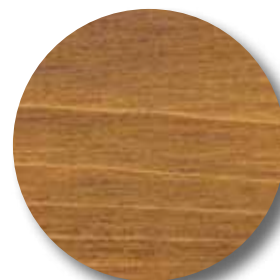
009 Dark Oak