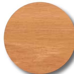
005 Natural Oak