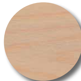
113 Cape Cod Grey