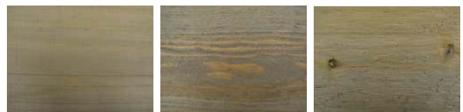
Color Smoky Sky on Different Wood Textures