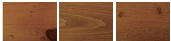
Color Cimarron on Different Wood Textures