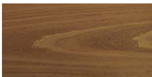
Saddle Brown #235