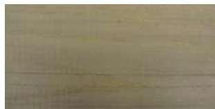
Smoky Sky #263