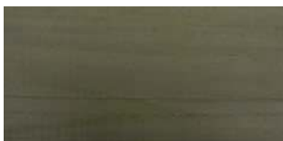
Silver Mist #262