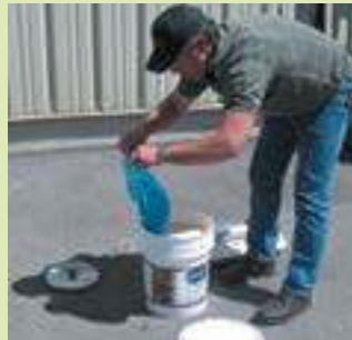
Remove the lid and the plastic liner from the pail