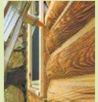
Fill the 3/8" gap between the surface of the foam and the edge of the frame with sealant