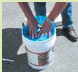
Replace plastic liner over the surface of the sealant