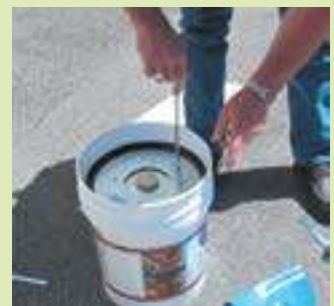
Insert the handle rod into the open nut to remove the follow plate