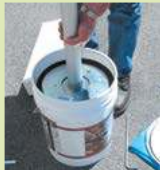
Remove the cap and cone tip from the gun barrel and push the end of the barrel onto the hole