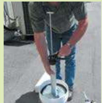
Ensure the tight seal, fully extend rod and fill the barrel. Disengage from the follow plate