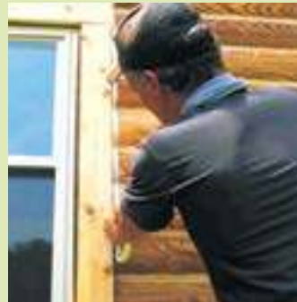
Apply masking tape to prevent sealant from smearing onto the adjacent logs