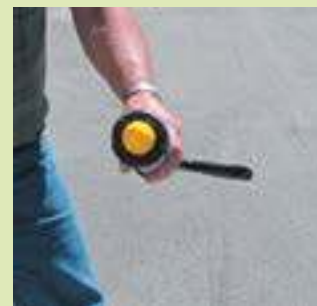
Attach the end cap and cone tip to the end of the barrel