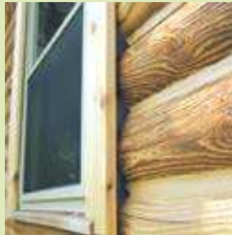
Insert Log Gap Cap™ into void between logs and frame. Leave 3/8" gap between surface of foam and edge of frame