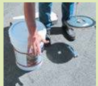
Replace the lid. Make sure that it is tight on the pail