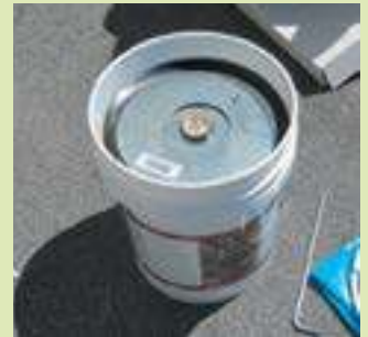
Place the follow plate on top of the chinking pail