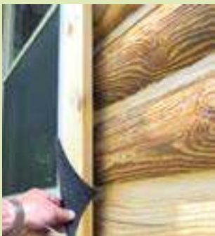
Use Log Gap Cap™ where round logs meet window and door jamb trim