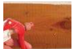
FINISH REPELS WATER

For more detailed questions about exterior maintenance contact any Perma-Chink Systems branch.