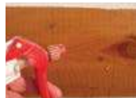
FINISH REPELS WATER

For more detailed questions about exterior maintenance contact any Perma-Chink Systems branch.