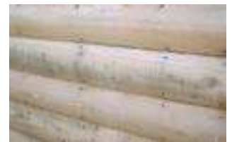
Dark colored streaks caused by metallic tannates. Oxcon solution will also remove rust stains caused by nails, screws and fasteners.