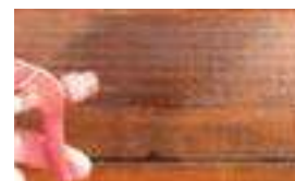
FINISH LOST IT'S WATER REPELLENCY