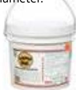
Exterior Protects exposed log ends

30-40 sq.ft. per gallon. One gallon will coat approximately 180 log ends with 6" diameter.