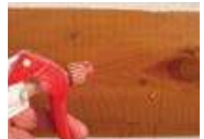
FINISH REPELS WATER

For more detailed questions about exterior maintenance contact any Perma-Chink Systems branch.