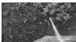
PRESSURE WASHING 3000 PSI