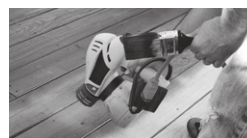
APPLY SECOND COAT 30 MINS TO 1 HOUR AFTER FIRST COAT